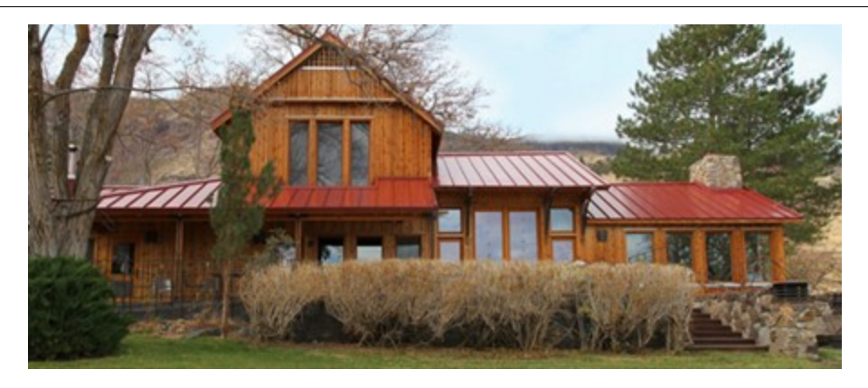
PLAYA at Summer Lake