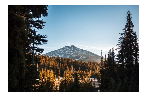
Mapping Memoir: A Writing Intensive December 4-5, 2020

guest presenters will lead a generative workshop addressing who, what and why as, after months of incubation, hibernation and contemplation, we return to a world of more activity. Established and emerging writers will leave the retreat with renewed commitment and inspiration. The retreat, held at the Yamsi Ranch on the Williamson River, is limited to 12 to ensure an intimate setting and